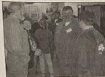
Always a happy man and a smile for all.

Wisdom and Advice... A helping hand to all.