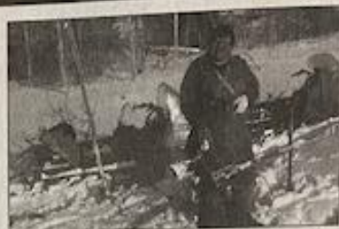
Hunted, fished and trapped — a true Caretaker of Nature.